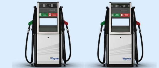
Logos PaySys or PayPoint OPT controls multiple fueling points